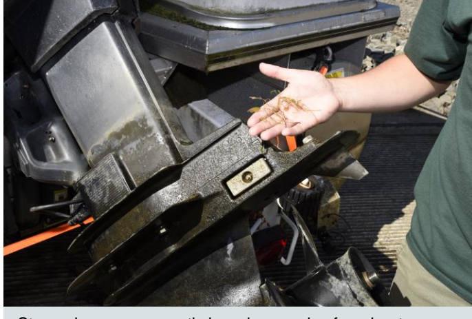
Steward removes aquatic invasive species from boat.