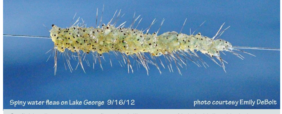
On fishing lines, spiny waterfleas look like masses of bristled jelly with dark spots scattered throughout.

Spiny waterfleas also interfere with fishing, as their spines catch on fishing line, resulting in clogged fishing rod eyelets and damaged reel systems, preventing fish from being reeled in.