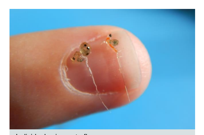
Individual spiny waterfleas.

Spiny waterfleas live in fresh water habitats and prefer cold temperatures, but can tolerate both brackish and warm water. They have spread throughout the Great Lakes and have been found in more than ten counties in New York State. Lake Erie, Lake Ontario, Lake George, Great Sacandaga Lake, Stewarts Bridge Reservoir, Lake Champlain and a number of smaller water bodies are infested.